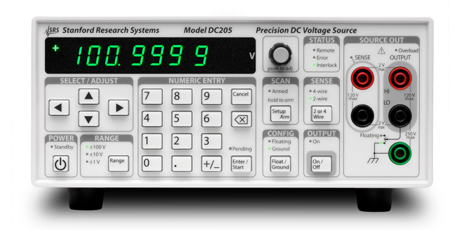
DC205 front panel

The DC205 has both RS-232 and USB computer interfaces on its rear panel. All functions of the instrument can be set or read via the interfaces. For remote interfacing with complete electrical isolation, the DC205 also has a rear-panel fiber optic interface. When connected to the SX199 Remote Computer Interface Unit, a path for controlling the DC205 via GPIB, Ethernet, and RS-232 is provided.