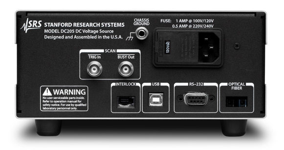
DC205 rear panel